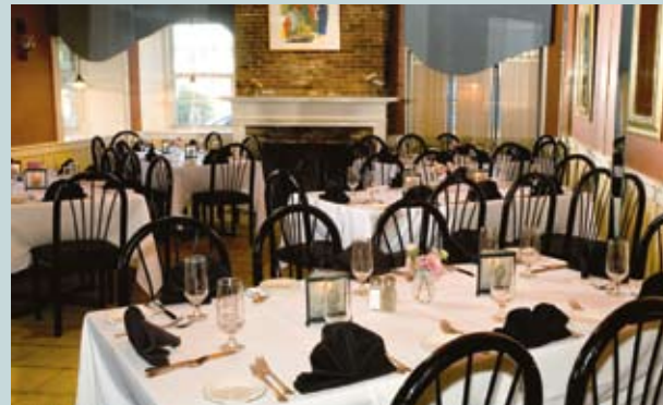
Our main dining room set up for a function.

David's Tavern can accommodate up to 60 people for a served meal and 48 for a buffet event. We can also cater your off-premise event for groups of 20 to 175. We are pleased to be the "preferred caterer" for several well-known local function halls. Please call us for more information or visit www.davidstavern.com .