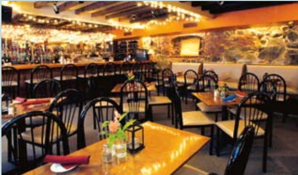
Our popular cozy brick-walled pub, downstairs.

At David's Tavern, you will find creative cuisine in a casual atmosphere. You may choose from our main dining room on the street level, or our popular cozy brick-walled pub with live entertainment and raw bar downstairs. Our dinner menu offers a variety of tastes for every palate.