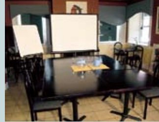
Business meeting setup.

David's Tavern is the perfect location for your personal or business event. Rehearsal dinners, small weddings, bridal showers, business meetings, and/or company holiday parties are just a few of the special events that David's Tavern will host for you. Select from brunch, luncheon, dinner, or hors d'oeuvres menus, with an impressive complement of fine wines. We specialize in intimate to medium-sized parties with emphasis on personalized attention to every detail.